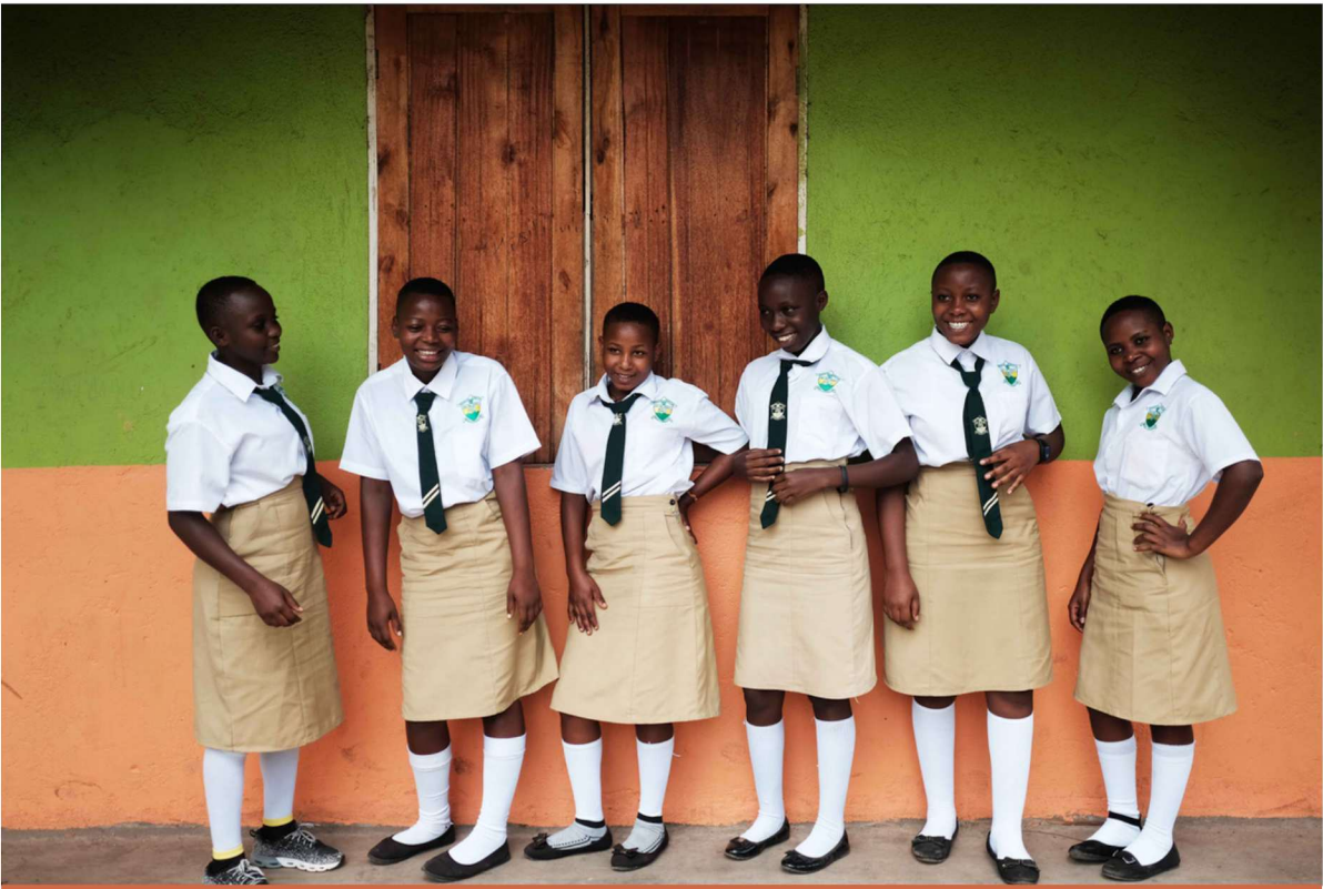
Secondary school – Just some of our brilliant girls who aspire to become the next future stars