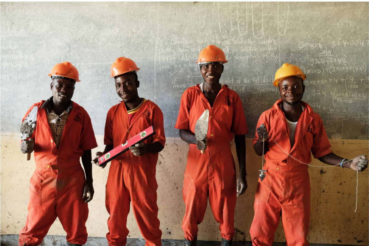
Vocational training – The Katwe Vocational Institute where future builders, engineers, fashion designers, tailors, and mechanics are made.