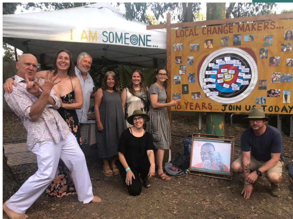
Gathering new donors and celebrating 18 years at Castlemaine Idyll